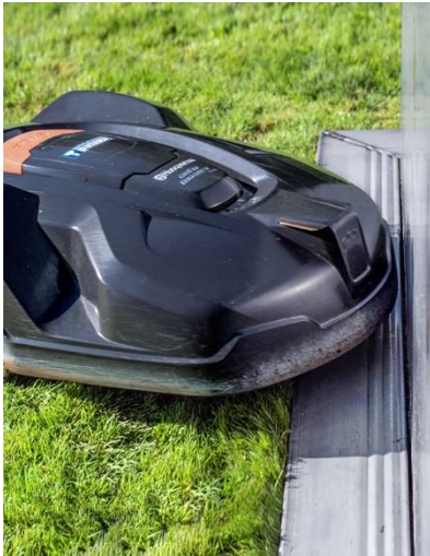
Mowing angle with mowing robot